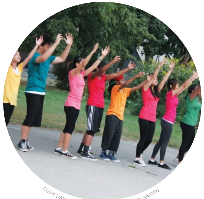
DUSK DANCES

However we recognize that context and identity, or where someone is coming from, can be useful in helping readers to understand a quote or perspective; therefore, we have included basic roles alongside quotes such as: visual artist, community health worker, youth support worker, arts administrator, youth leader, educator, etc.