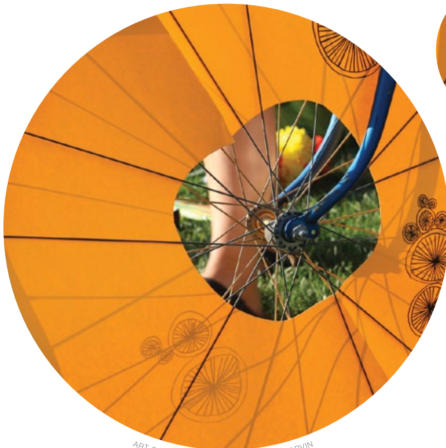
ART SPIN; PHOTO BY SARAH MILLER-GARVIN

Tips for first-time organizers of an advisory group. https://www.thebalancesmb.com/your-first-advisory-board-meeting-2947125